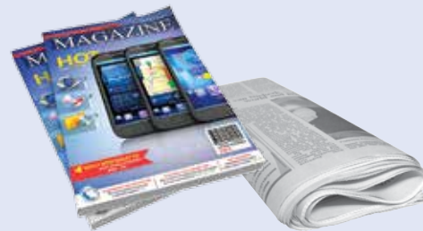
Magazines and newspapers