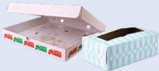
Cardboard (Remove plastic and food)