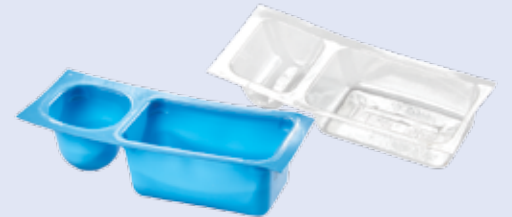
Hard plastic food containers (Tops are garbage)