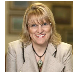
Sylvia Jones Dufferin-Caledon PC