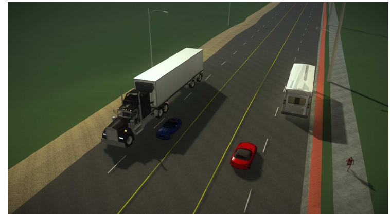
Existing 4 lane roadway