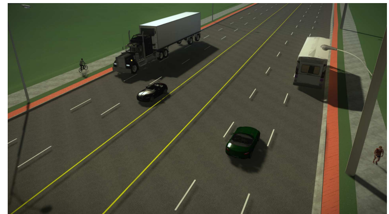
Proposed 6 lane roadway