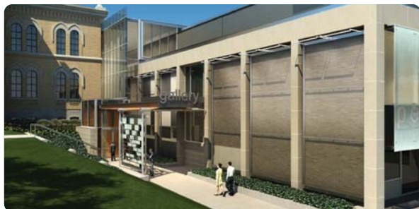
Artists Rendering: Entrance of Art Gallery from Main Street.