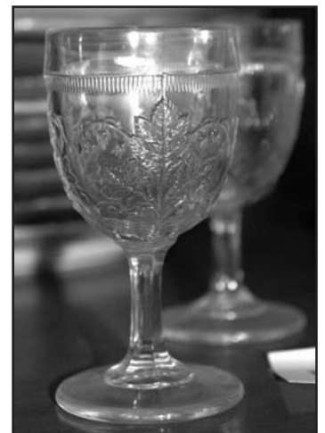
Pressed glass wineglass with lily-of-the-valley pattern, circa 1875, attributed to King, Son & Company, Burlington Glass Works, Hamilton.