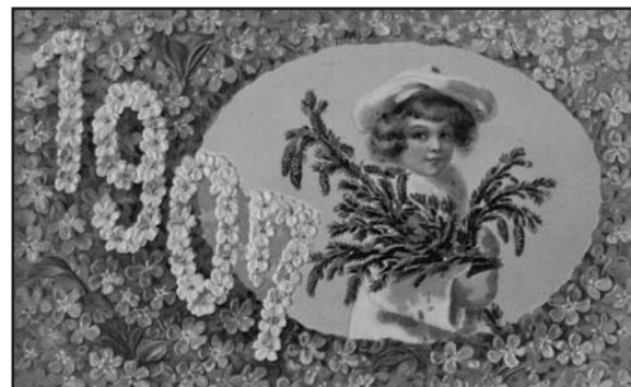
From our 'home' to yours, the staff at the PHC wish you all the very best for 2011 – it will be an exciting year!