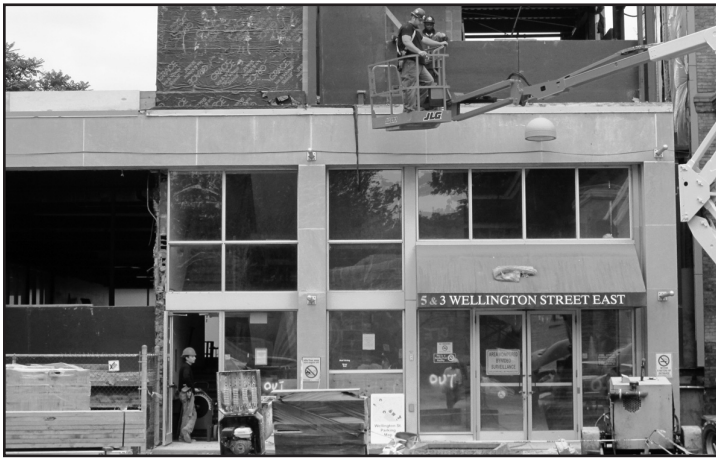
Workers look over blueprints for the new Members Lounge on the second floor of the new Art Gallery. Construction of the gallery's loading door (far left) is well on its way.