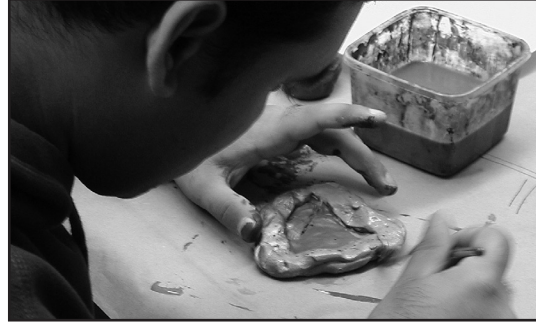
The Creative Therapy Program is one of the many programs we run that inspire others to ignite their artistic side.

The Peel Heritage Complex will have new hands-on activities for all ages that will complement our Archives, updated Museum, and new Art Gallery. This will entice people ages 1 to 101 to touch, explore and wonder about the world around them.