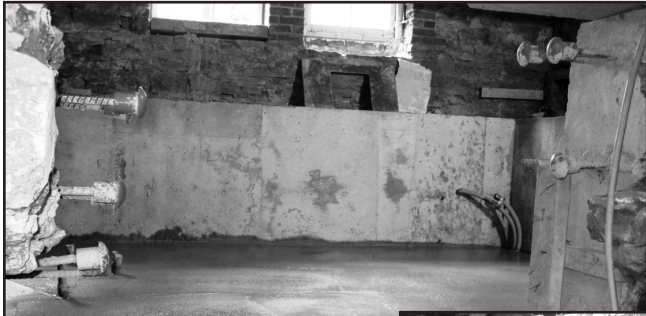
We are moving along nicely! This is the current state of the Courthouse basement—in our last issue of Strata we showed the same room at the start of our excavation (right).