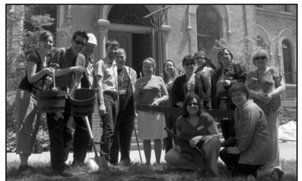
Peel Heritage Complex staff prefer to break ground the 19th century way!