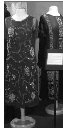
1920s dresses from the Museum Collection