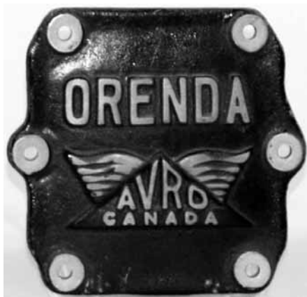
Aluminum name plate from an Orenda engine produced in Malton between 1950 and 1958

Increasingly, donations to the Museum are becoming more reflective of Peel's remarkable mid-twentieth century history. This was reflected in two donations that help illustrate the history of Peel's aerospace industry: a name plate from an Orenda jet engine, and a drafting table used at A.V. Roe.