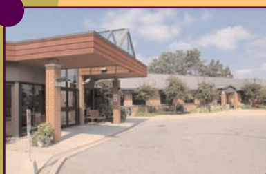
Peel Manor 525 Main St. N. Brampton, ON L6X 1N9 Phone: 905-453-4140