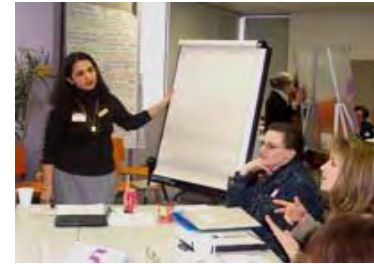
Participants Share Ideas as the MIAG Workshop

More than 30 participants provided feedback on the Draft Long Range Transportation Plan and the draft ROPA prior to Council adoption.