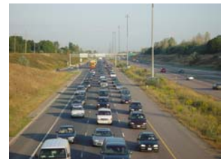
Traffic on Highway 410

Since transportation facilities are provided by all levels of government and the private sector, the work program will be conducted in co-operation with area municipalities, other levels of government and transportation agencies.