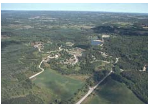
The Oak Ridges Moraine

For the ROPSU process, human services policies and housing policies will be reviewed, and it is expected that revised or new Official Plan policies will be recommended.