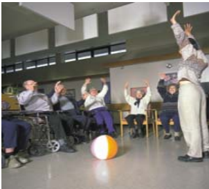
Seniors in Peel