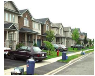
A residential neighbourhood in Brampton

The Region is also working with the City of Brampton to study the option of expanding the urban boundary in Northwest Brampton to accommodate growth. In addition, policies will be reviewed in light of new provincial policies, Smart Growth initiatives and updated municipal Official Plans.