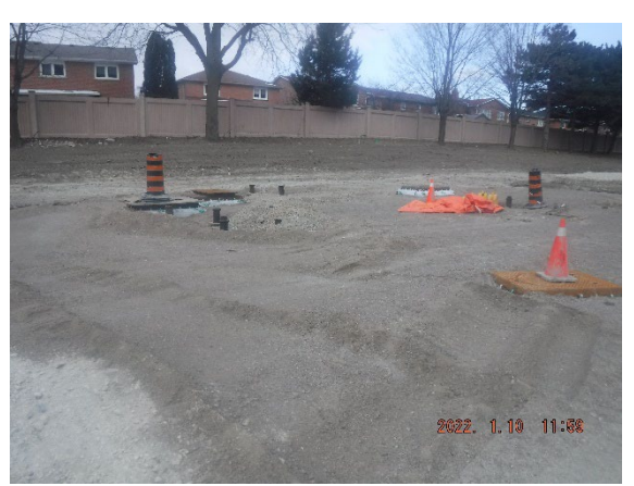
Chamber Backfill & Grading