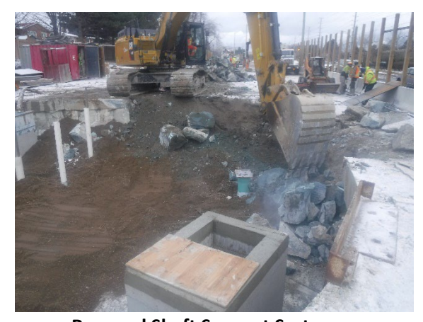
Removal Shaft Support Systems

We anticipate our work will be done by mid 2022. Your patience is appreciated as we build the necessary water infrastructure to support Mississauga's growing downtown core.