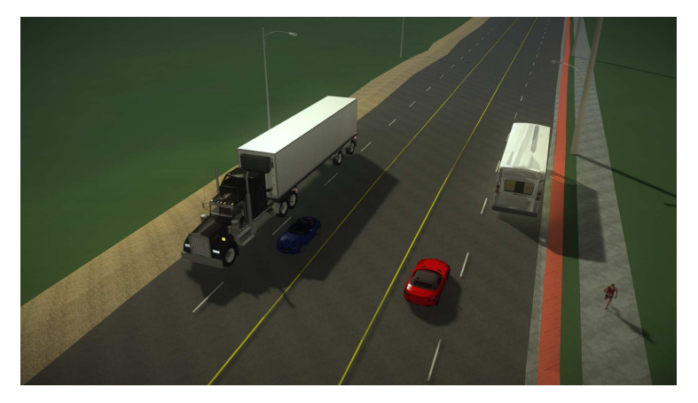
Existing 4 lane roadway