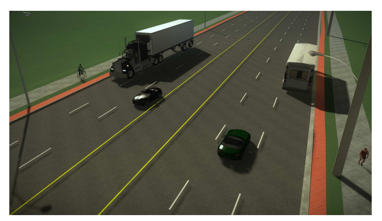
Proposed 6 lane roadway