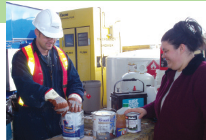
Bring your household hazardous waste to a CRC, free of charge