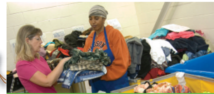
Donate gently used items at any CRC

Bring your household hazardous waste, electronics, recyclable and reuse materials to any of Peel's five CRCs.