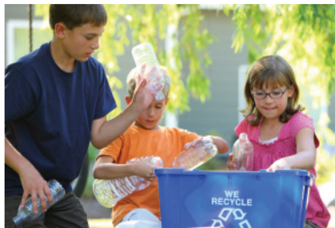
Recycling matters and everyone can help

With your participation in our various reuse and recycling programs, we are currently diverting 50 per cent of our waste from disposal. Another 20 per cent is converted into energy at the Algonquin Power Energy-from-Waste facility.