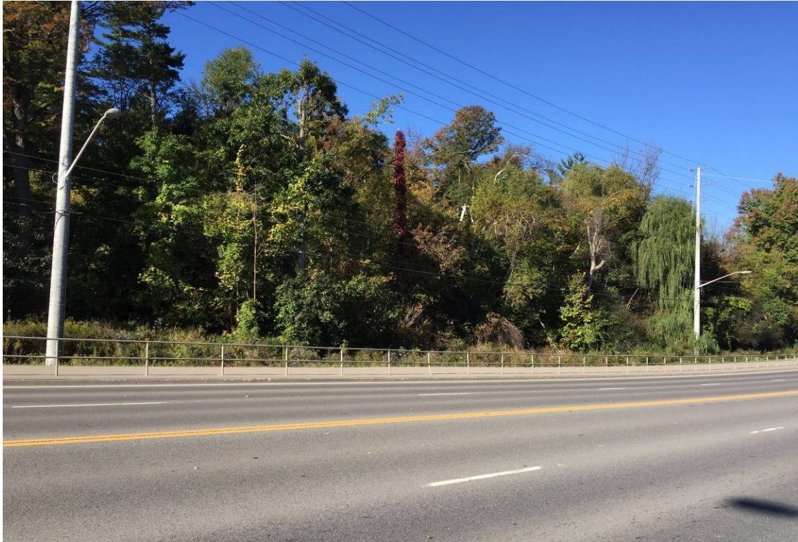
Photograph #4: A view looking north west showing the wooded slope on the west side of Mississauga Road.