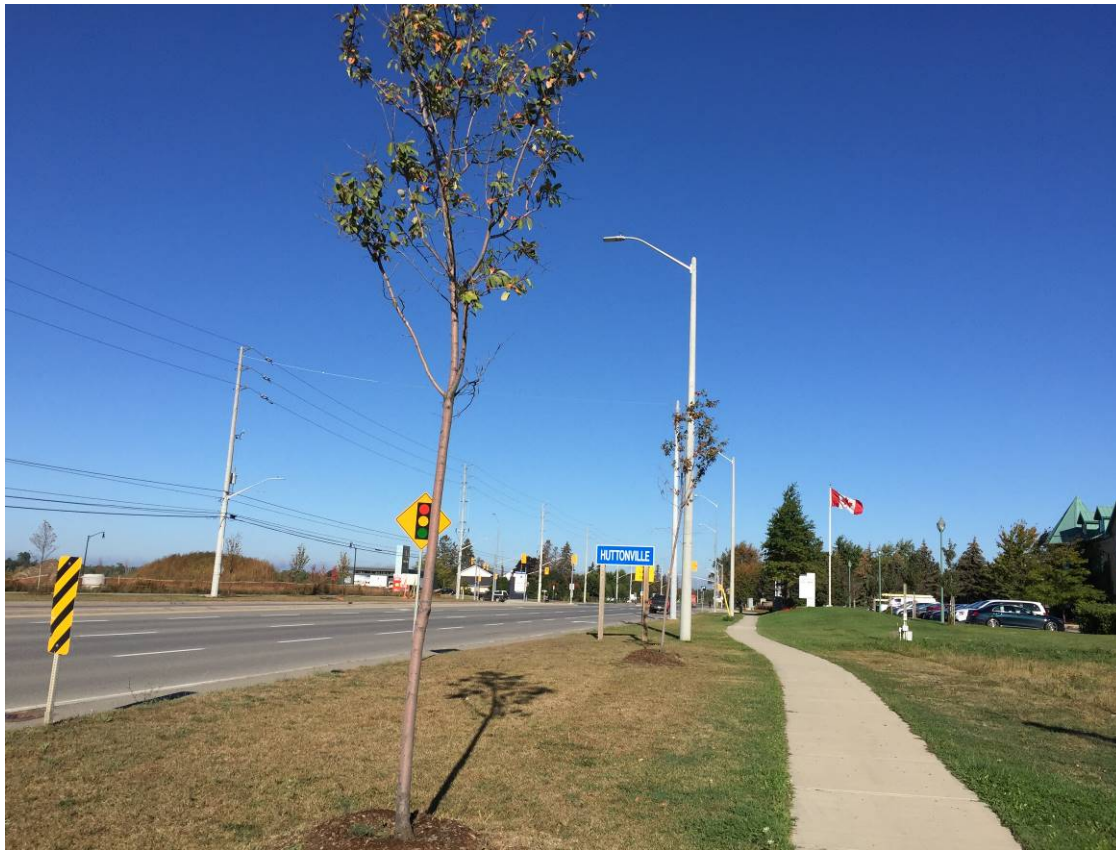
Photograph #1: View looking north along the east side of Mississauga Road, just north of Financial Boulevard showing recently planted street trees.