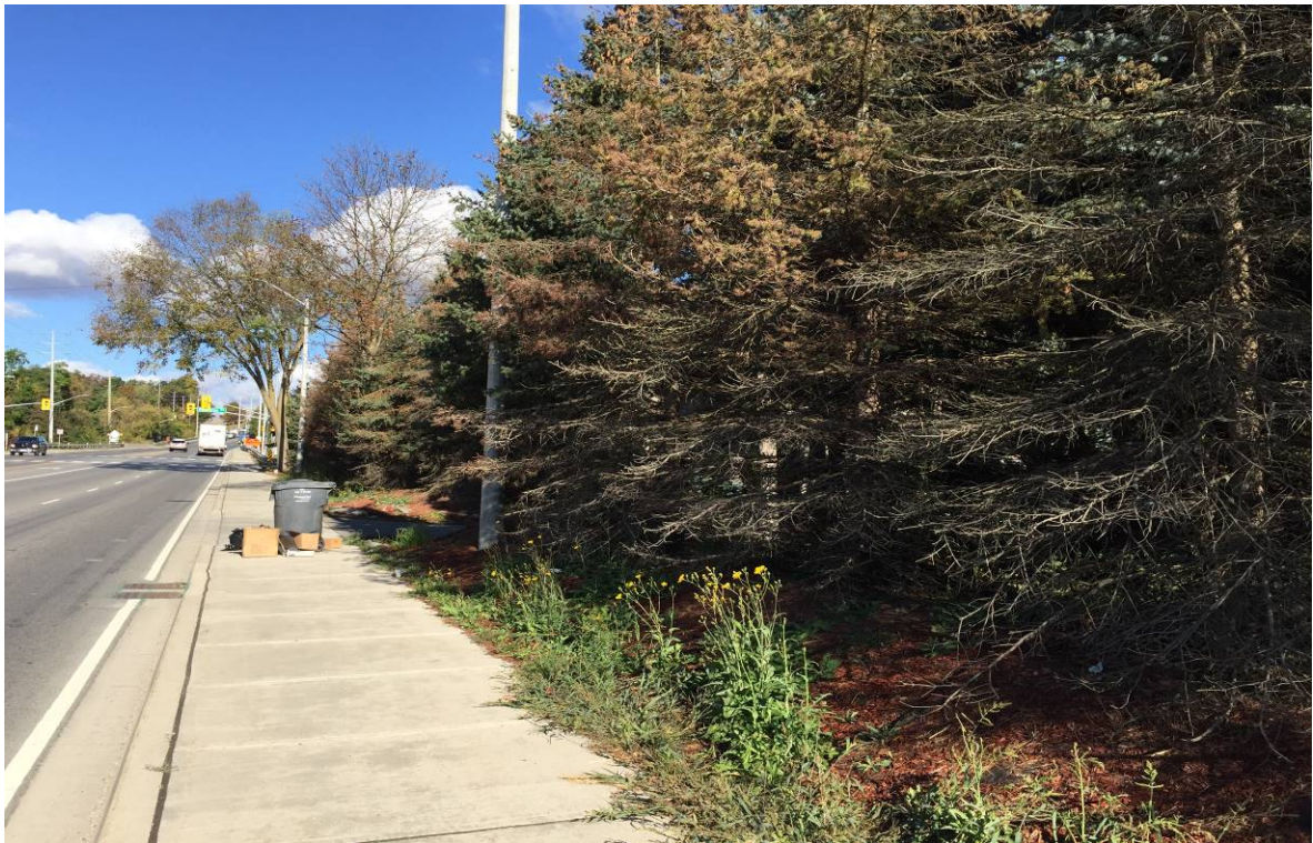
Photograph #7: A view looking north down the east side of Mississauga Road, showing the row of Spruce trees along the residential frontage