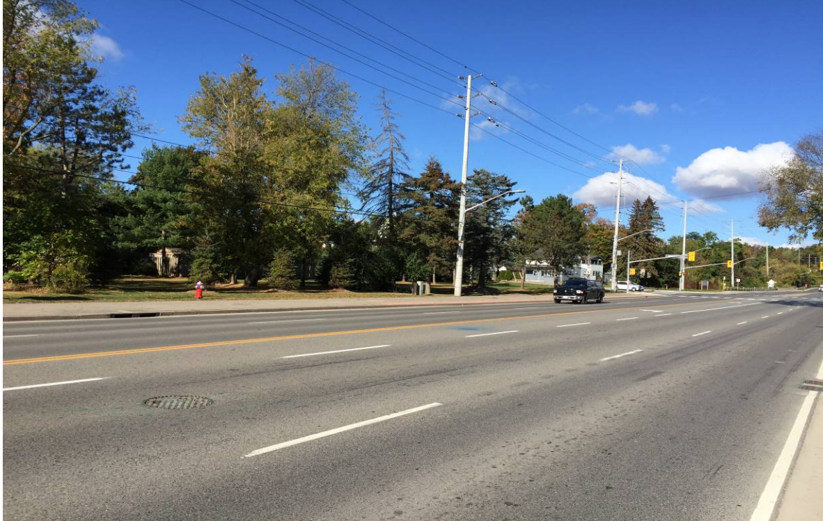
Photograph #6: A view looking north-west, showing the scattered mature vegetation along the west side of Mississauga Road, south of Embleton Road.