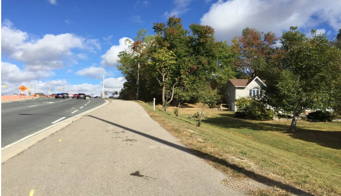
Photograph #10: A view looking north along the east side of Mississauga Road, showing some recently planted street trees and a wooded area in the background