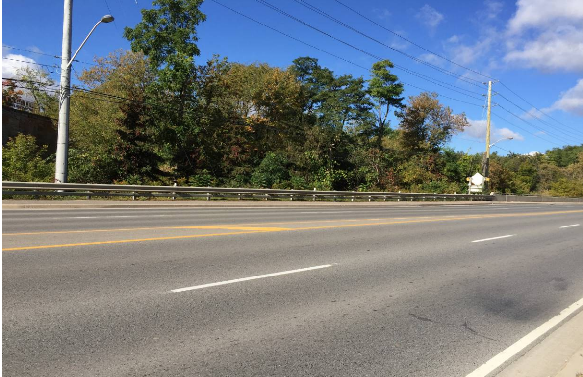
Photograph #8: A view looking north-west, along the west side of Mississauga Road, of the wooded area located on the south bank of the Credit River.