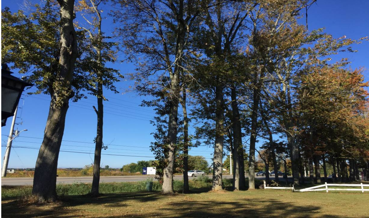
Photograph #2: A view of the row of Silver Maple trees located along the east side of Mississauga Road.