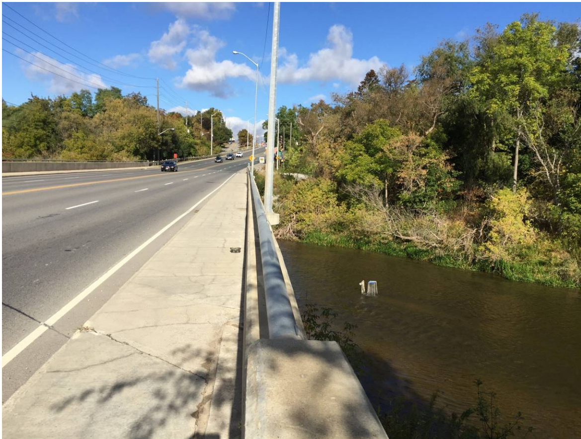
Photograph #9: A view looking north along the east side of Mississauga Road, showing the wooded slopes along the Credit River.