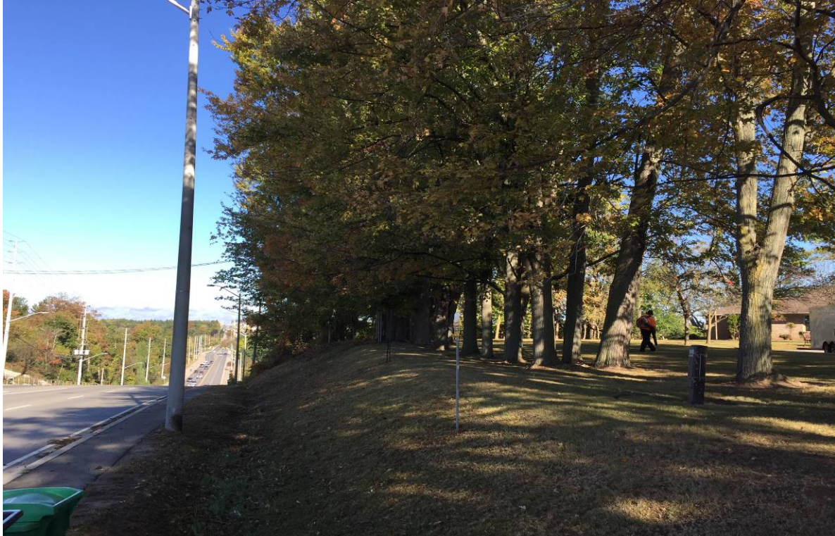
Photograph #3: A view of the same row of mature Silver Maple trees along the east side of Mississauga Road.