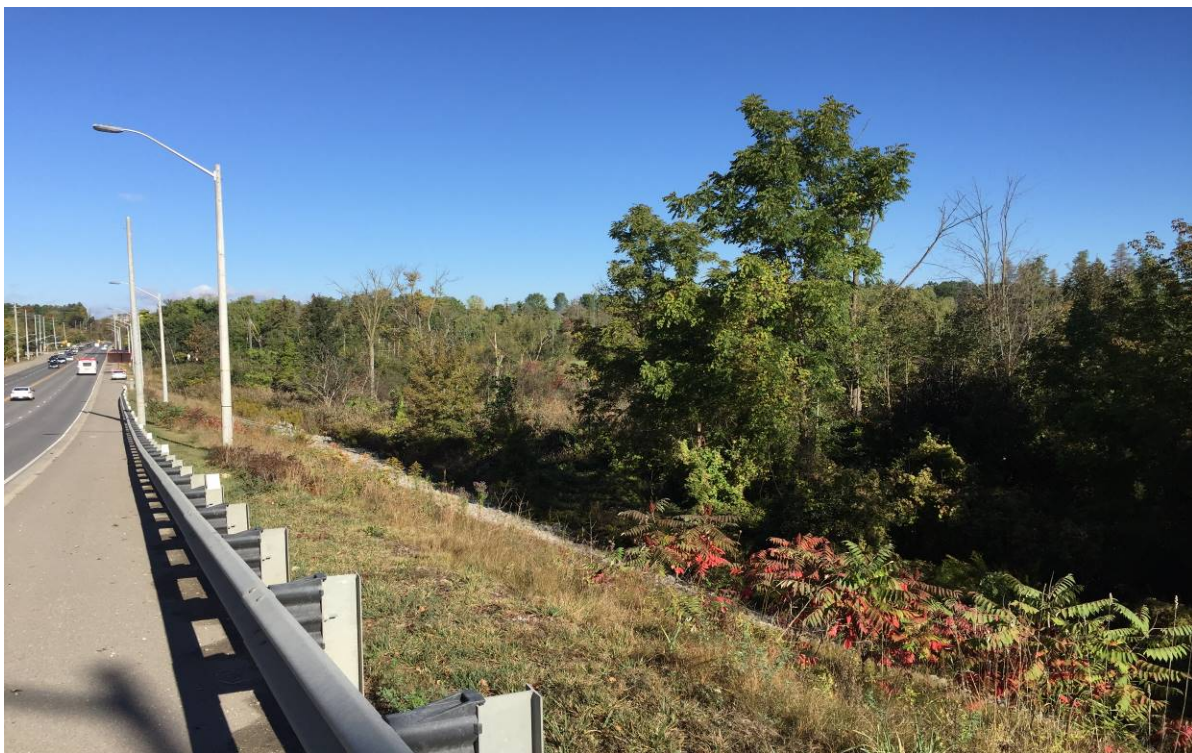
Photograph #5: A view looking north along the east side of Mississauga Road showing the wooded area associated with the valley slope.