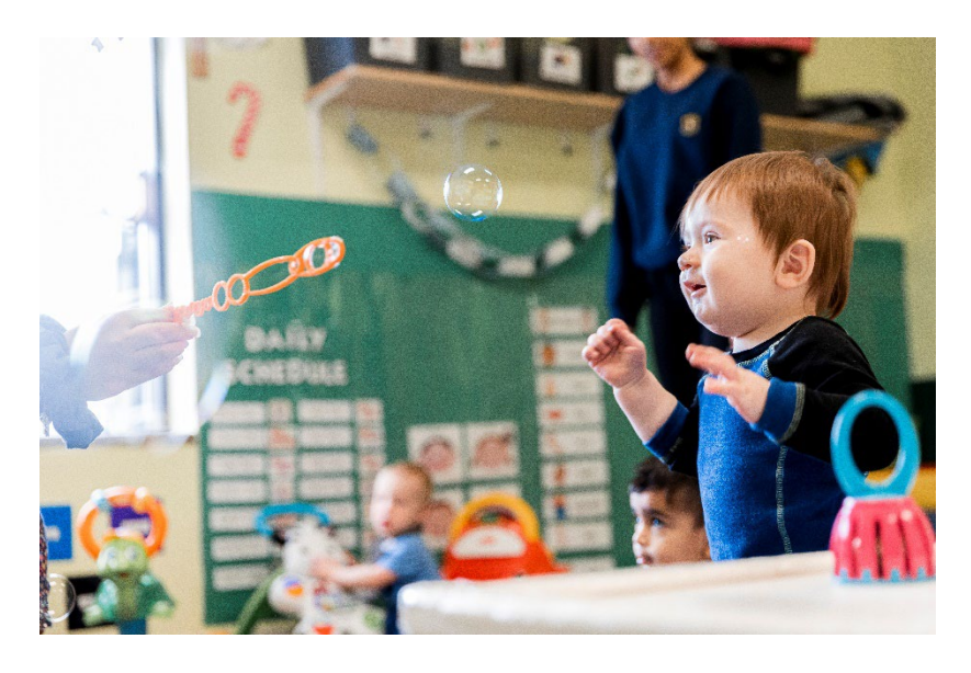
Providing safe licensed child care facilities is important as many parents rely on child care to be able to go to work or school.

The 2024 Capital Budget provides $338,000 between the five properties. This investment ensures that these buildings are properly and safely maintained and running smoothly in a reasonable state of good repair.