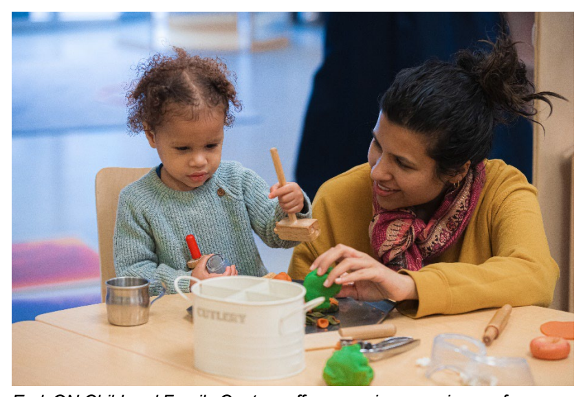
EarlyON Child and Family Centres offer engaging experiences for families with young children to learn, play and grow together.

• Launched Child Care Subsidy Portal – Early Years and Child Care Services introduced an online portal to allow families who receive child care subsidy to securely exchange information with the program and better manage their records. This includes updating and accessing information online at their convenience and communicating directly with Peel staff. The improvements secure the transmission of information and end the need to fax and email documents. The result is less paperwork and shorter processing times for families while making it easier for them to see the status of their information. This has eliminated manual administration, resulting in easier retrieval of information and better and quicker communication between families and our staff.