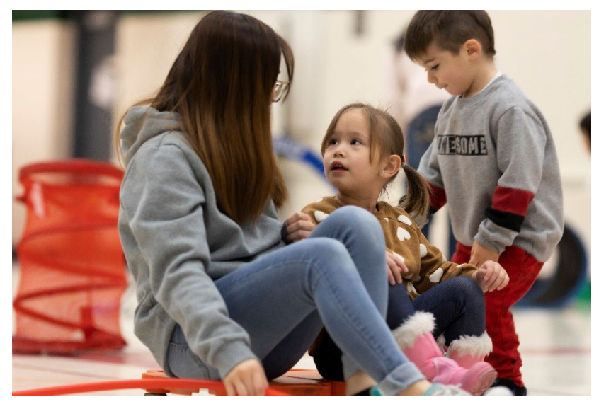
A growing early years and child care sector needs a growing and skilled workforce.

We will continue to engage with residents to understand their experiences using the services we provide, as well as the impact on their children and families. The information will help to inform and improve our work within the sector.