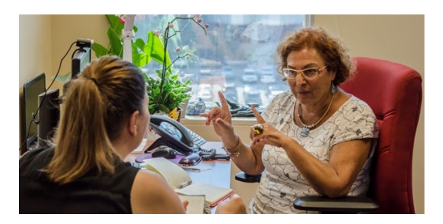
Figure 1 Providing ongoing case management and stability supports to social assistance recipients

Another relevant trend impacting Income Support Services is the significant rise in the cost of living. However, the Ontario Works benefit rates have not changed since 2018 which means Ontario Works clients struggle to meet even basic needs (housing, food, clothing). This trend, combined with growing and increasingly complex caseloads may mean that additional funding is required in future years.