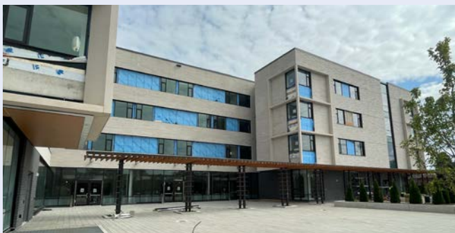
Adult Day Services courtyard