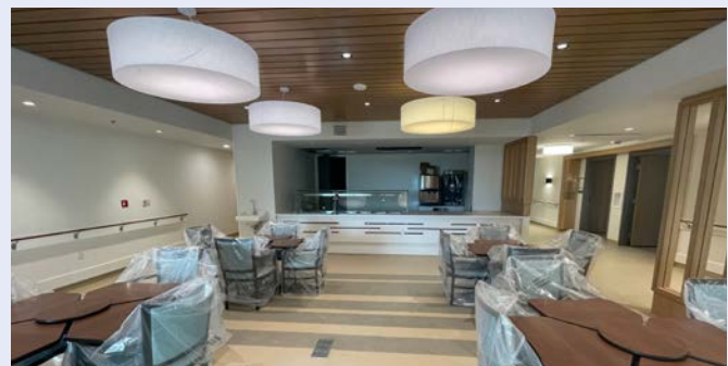
Fourth floor dining area