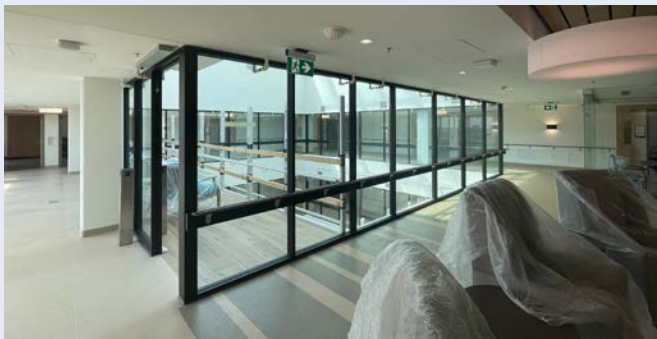
Fourth floor atrium