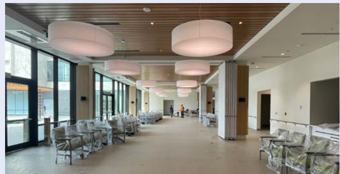
Adult Day Services dining area