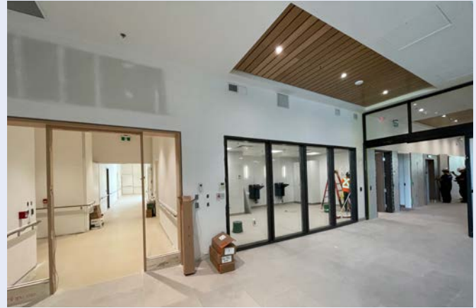
The salon/spa area

Stay tuned for updates and information about services our community can look forward to at the SHWV at Peel Manor as we get closer to our grand opening.