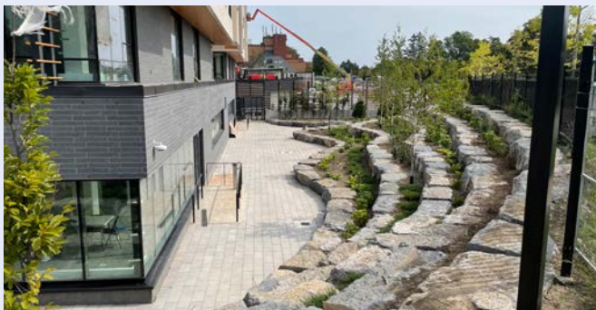
Outdoor staff courtyard

Check out some recent photos of the progress that has been made: