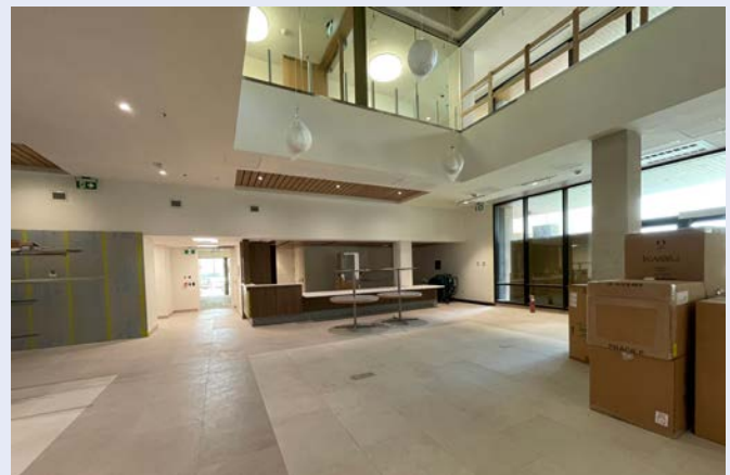
The café area