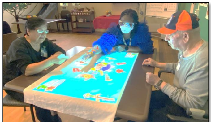
Staff and participants engaging with our new interactive Obie equipment.