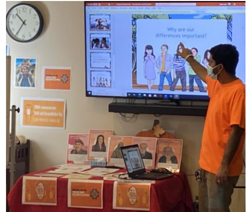
Staff led discussion about Truth and Reconciliation and Diversity.

Supervisor, Adult Day and Community Support Services