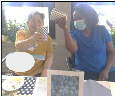
Appreciating the health benefits of blueberries.