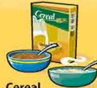
Cereal Cold: 30 g Hot: 175 mL (¾ cup)