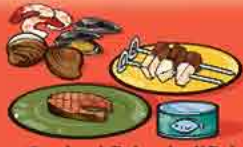
Cooked fish, shellfish, poultry, lean meat 75 g (2 ½ oz.)/125 mL (½ cup)