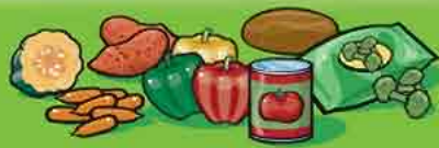
Fresh, frozen or canned vegetables 125 mL (½ cup)