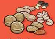
Shelled nuts and seeds 60 mL (¼ cup)