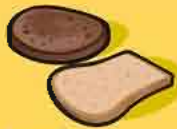
Bread 1 slice (35 g)