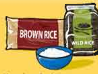
Cooked rice, bulgur or quinoa 125 mL (½ cup)