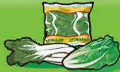
Leafy vegetables Cooked: 125 mL (½ cup) Raw: 250 mL (1 cup)