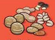
Shelled nuts and seeds 60 mL (¼ cup)