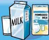
Milk or powdered milk (reconstituted) 250 mL (1 cup)