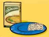
Cooked pasta or couscous 125 mL (½ cup)