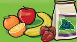
Fresh, frozen or canned fruits 1 fruit or 125 mL (½ cup)