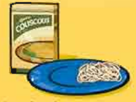
Cooked pasta or couscous 125 mL (½ cup)