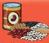
Cooked legumes 175 mL (¾ cup)