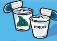
Yogurt 175 g (¾ cup)