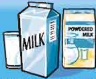
Milk or powdered milk (reconstituted) 250 mL (1 cup)