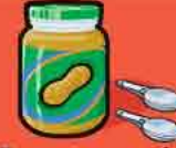
Peanut or nut butters 30 mL (2 Tbsp)