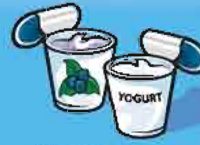
Yogurt 175 g (¾ cup)