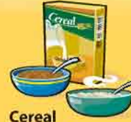
Cereal Cold: 30 g Hot: 175 mL (¾ cup)