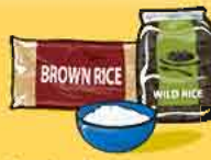
Cooked rice, bulgur or quinoa 125 mL (½ cup)