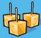
Cheese 50 g (1 ½ oz.)