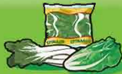
Leafy vegetables Cooked: 125 mL (½ cup) Raw: 250 mL (1 cup)